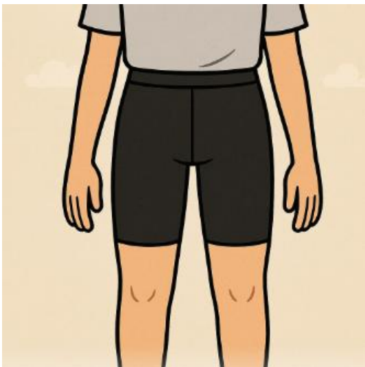
Correct length, as it is level with the fingertips

We appreciate your support in helping us maintain these standards and encourage you to speak with your child to ensure their PE kit meets the school's expectations.